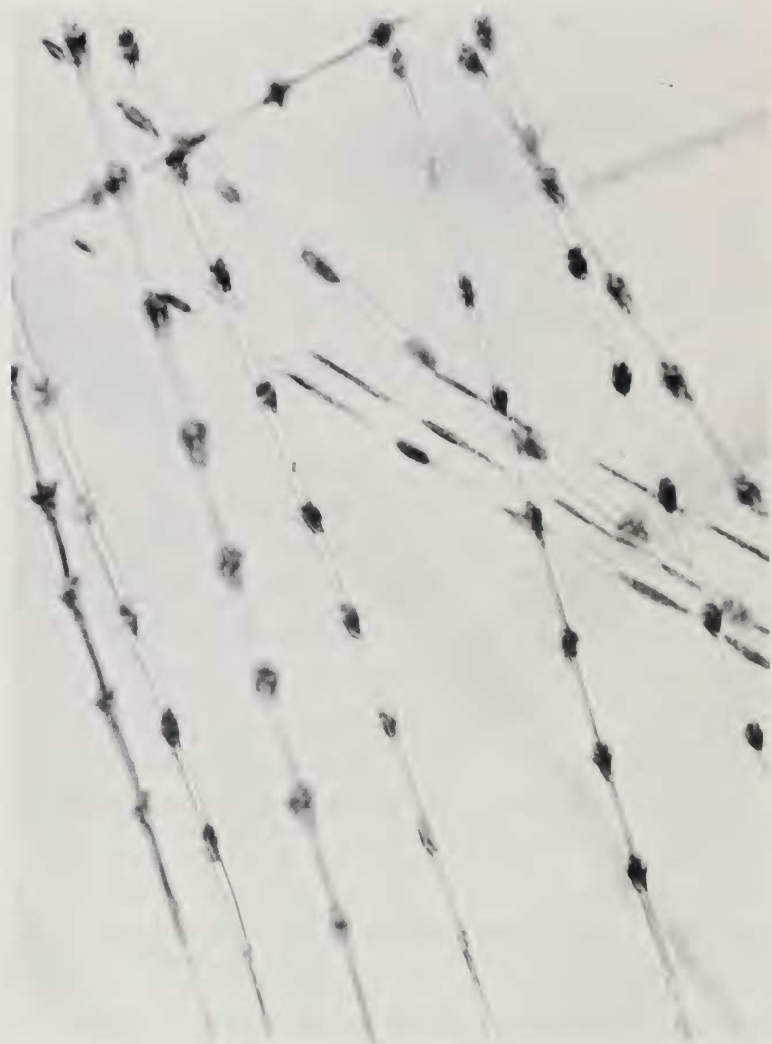
FIG. 2. Photomicrograph (250 \times ) of downy barbules of fossil feather.

width of the internode, nodal morphology, and the relative distance between the nodes. The fossil feather contained in USNM 469150 was compared with feathers of likely species of non-passerines that now occur in the area where the amber was found—Gray-headed Quail-Dove ( Geotrygon caniceps ), Narrow-billed Tody ( Todus angustirostris ), Broad-billed Tody ( Todus subulatus ), and Hispaniolan Trogon ( Priotelus roseigaster ). We also studied species not now occurring in the area, for example: